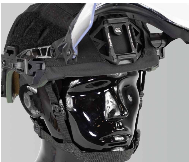
Laminate Helmet Cover Brim