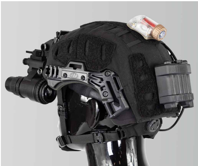
IR & Battery Velcro Retention