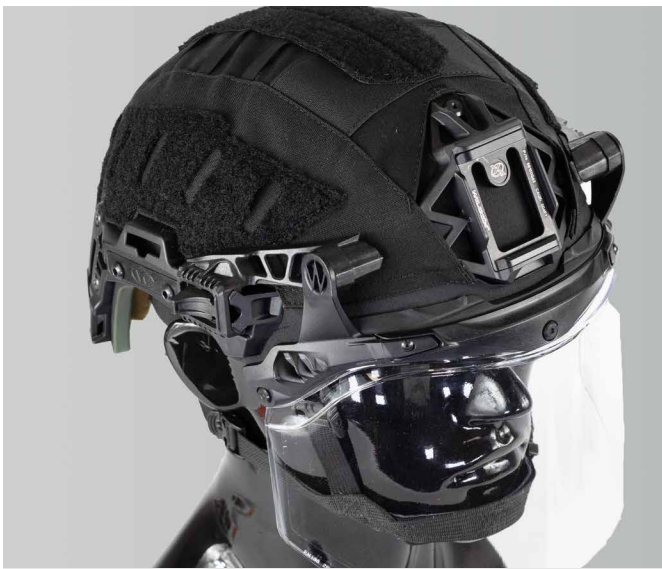
Helmet Cover & Visor Rubber Flange Integration