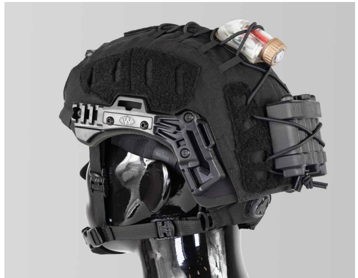
IR & Battery Pack Secondary Retention