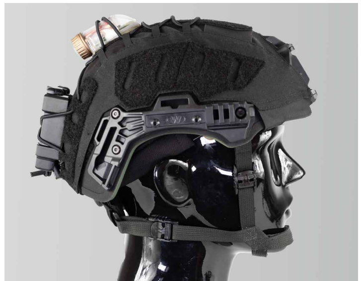
Alternative Routing Additional Scrim & Cable Management