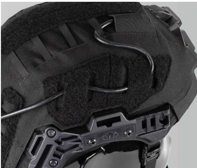
Laser Cut Velcro Cable Management