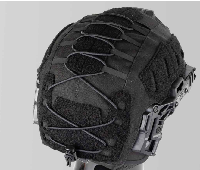
Standard Routing Configuration