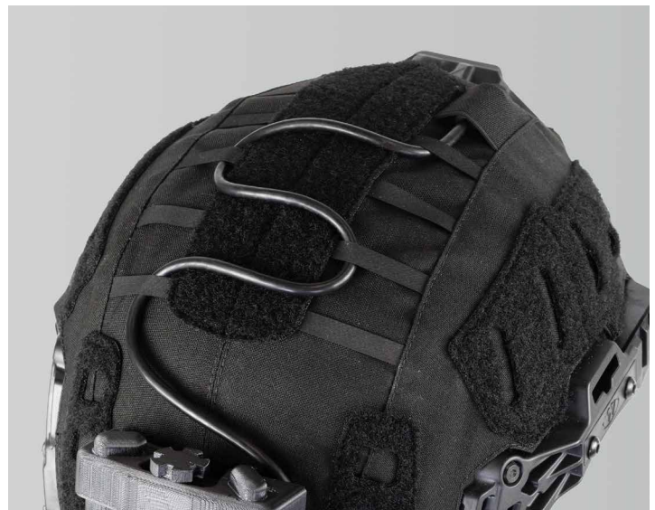
Laminate Cable Management & Cable Connection Elastic Keeper