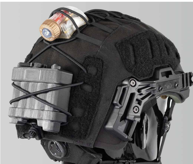
IR & Battery Pack Secondary Retention