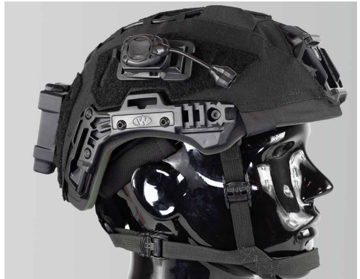
Task Light Velcro Retention