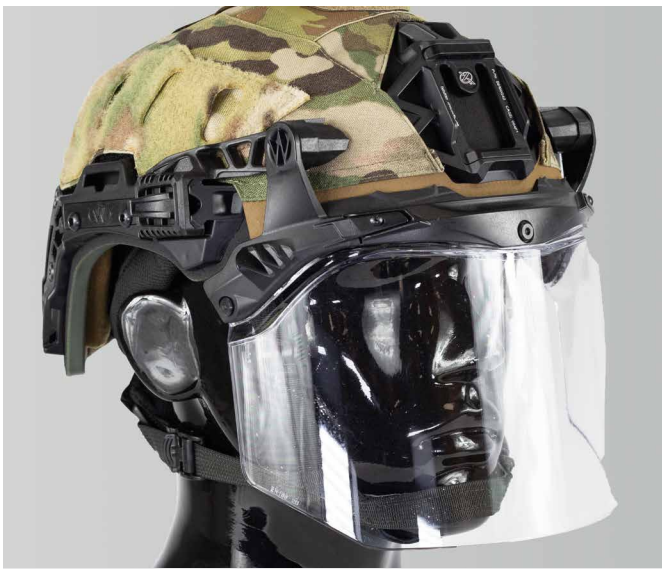
Helmet Cover & Visor Rubber Flange Integration