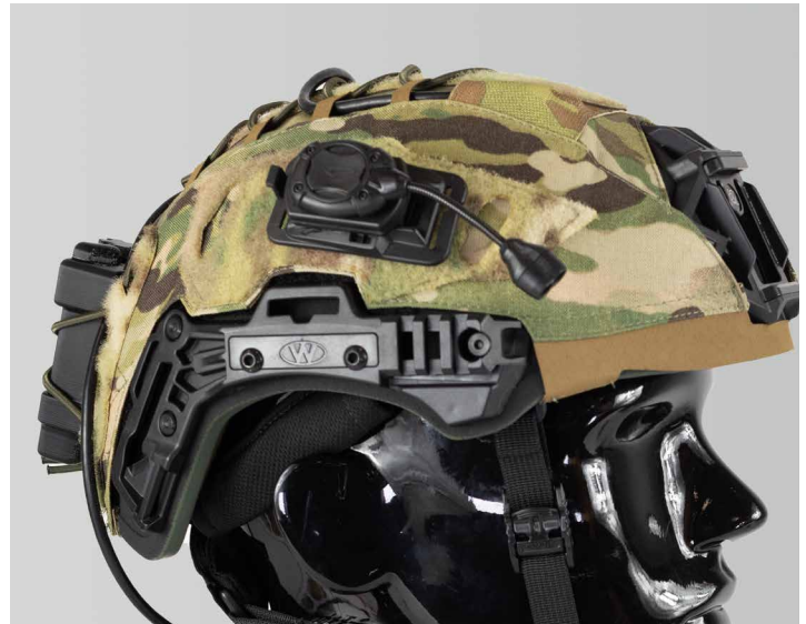
Task Light Velcro Retention