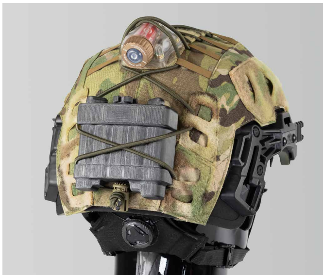
Alternative Routing IR & Battery Retention