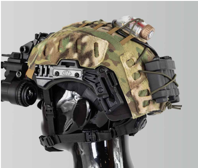
IR & Battery Velcro Retention