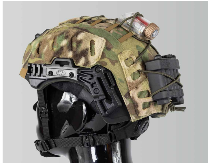
IR & Battery Pack Secondary Retention