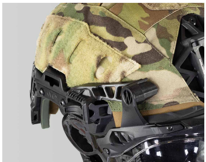
Laser Cut Velcro Visor Alignment