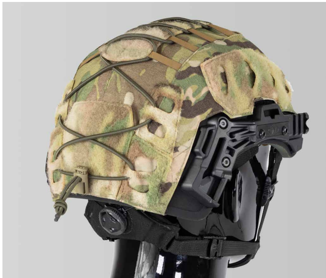
Standard Routing Configuration