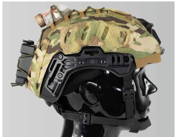
Alternative Routing Additional Scrim & Cable Management