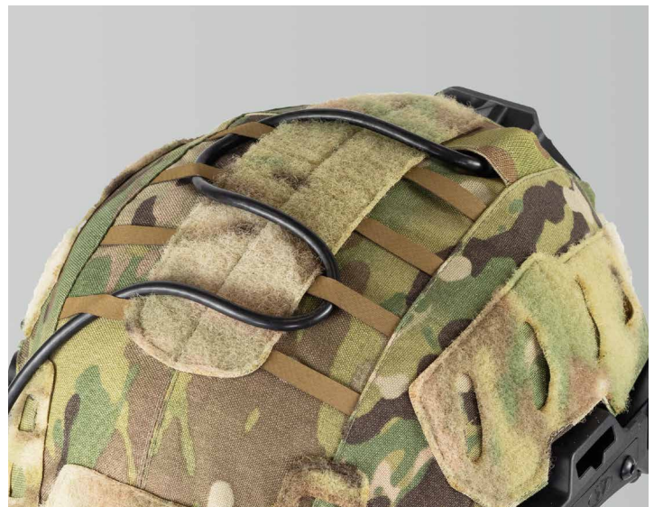
Laminate Cable Management & Cable Connection Elastic Keeper